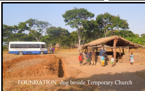
FOUNDATION dug beside Temporary Church