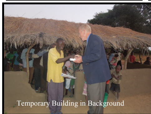
Temporary Building in Background