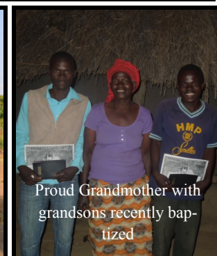
Proud Grandmother with grandsons recently baptized