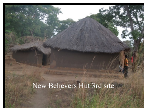
New Believers Hut 3rd site