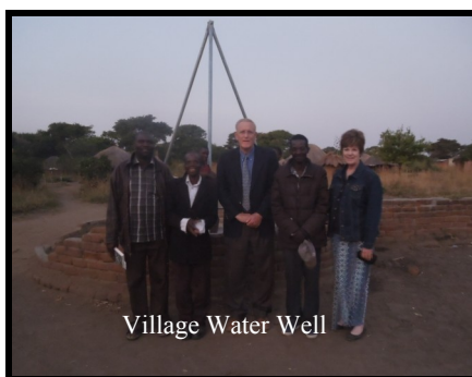
Village Water Well