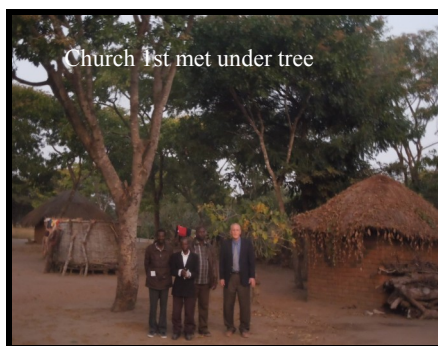
Church 1st met under tree