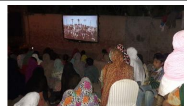
Jesus Film - Pakistan