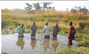
Baptism - Zambia