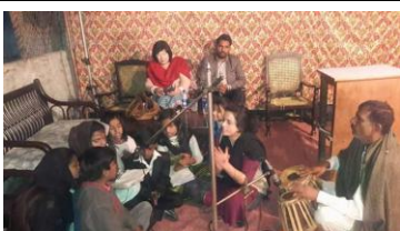
House Church - Pakistan