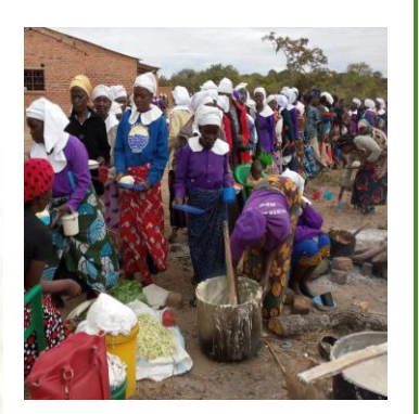
Lunch for the Ladies