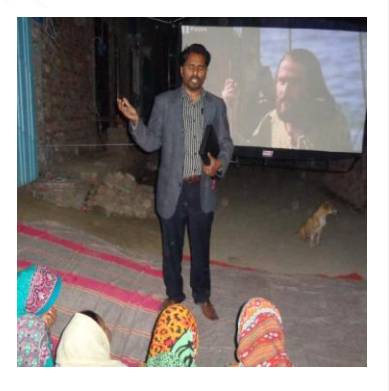
Mumtaz - Jesus Film